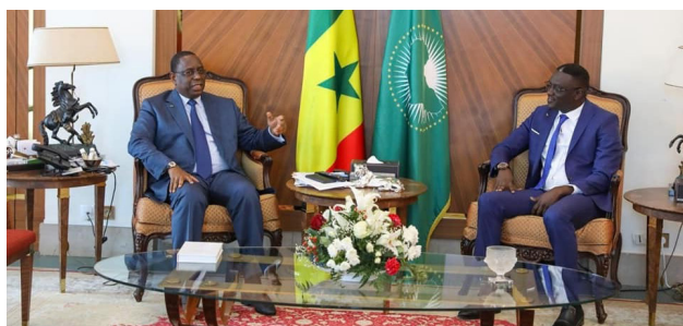
President Macky Sall expressed his commitment to strengthening epidemic preparedness in a meeting with GHAI partner ONG 3D on March 26, 2020.