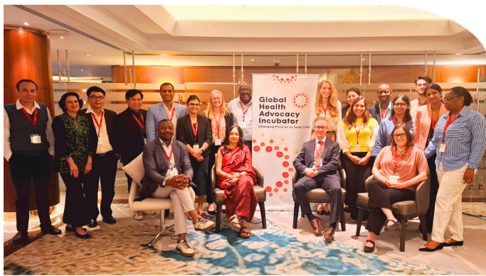
GHAI's Data for Health team from over 15 countries in Dubai, UAE, 2024

The Global Health Advocacy Incubator (GHAI) provides comprehensive technical assistance to governments to review, update and improve countries' legal frameworks for Civil Registration, Vital Statistics and Identity Management (CRVSID) systems.