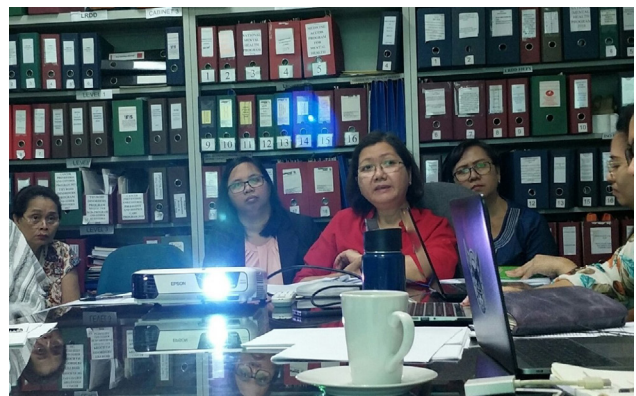
Members of the Healthy Diet Technical Working Group meet to discuss trans fat elimination.

ImagineLaw engaged key decisionmakers at the Department of Health (DOH) and beyond to explore next steps, and joined a Healthy Diet Technical Working Group (TWG) established by DOH in July 2019 to lead policy development. DOH held a series of meetings and workshops with the Philippines Food and Drug Administration (FDA), National Nutrition Council, WHO and other stakeholders to begin building support for the elimination of industrially produced TFA and explore policy pathways. DOH worked closely with ImagineLaw, WHO and others to craft a policy memo informing the development of TFA measures, including an administrative order directing FDA to establish a TFA limit and ban PHOs.