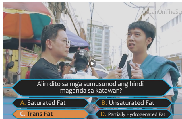
Comedian and TV host Stanley Chi incorporates messages about trans fat health harms into his popular #StanOn-TheStreet web series.

As COVID-19 spread around the world, pandemic response became the government's primary priority. ImagineLaw supported these efforts, while positioning TFA elimination as part of a long-term vision for strengthening public health and resilience, particularly as evidence grew linking chronic illness with increased risk of death and illness from COVID-19. Campaign partners shifted to digital technology to advocate, coordinate and implement activities, aided by strong relationships established pre-pandemic.