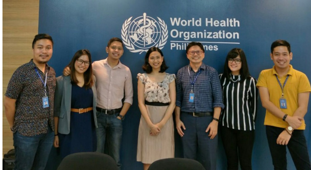
Representatives from the World Health Organization and ImagineLaw meet to discuss trans fat in the food supply.